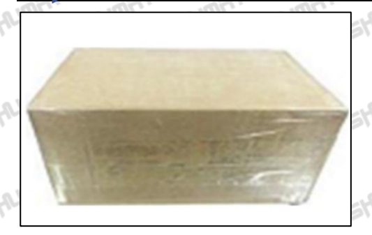
Pic No. 4 Domestic Express Packaging: Wrapped with transparent tape