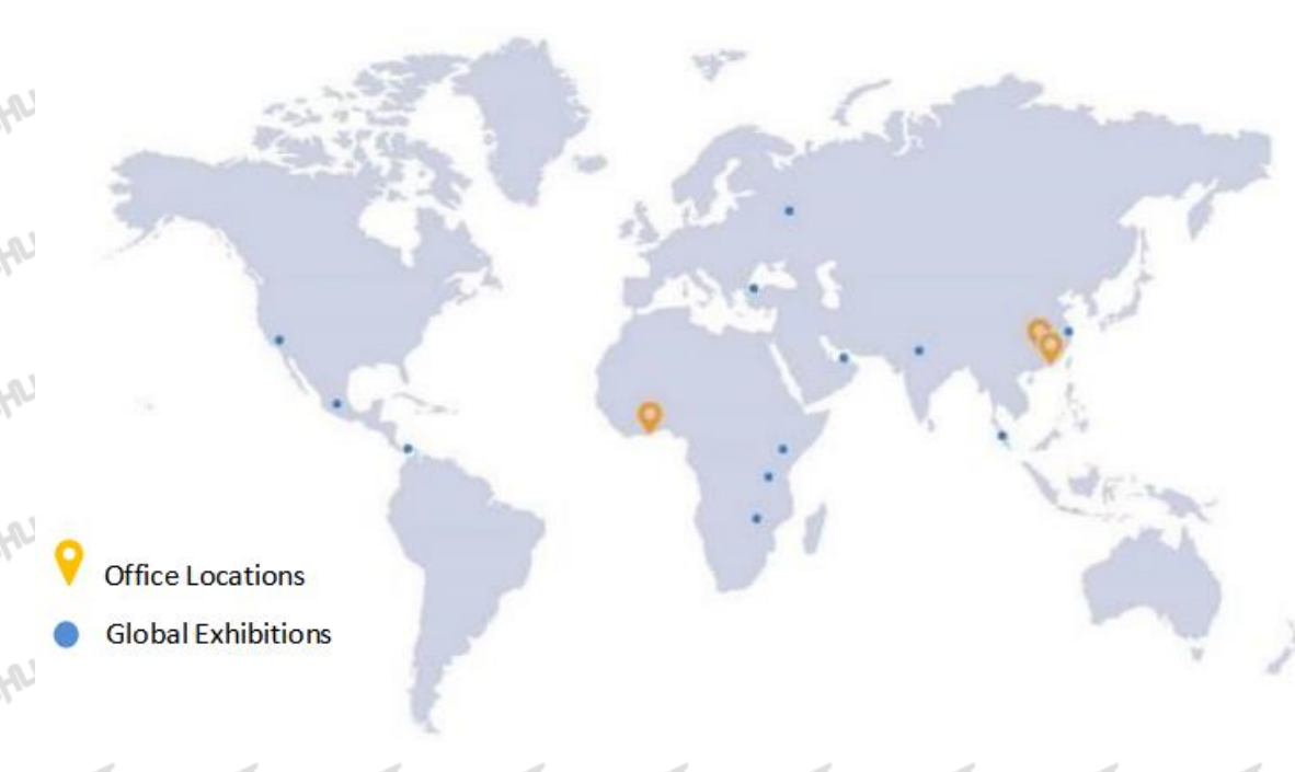
Pic No. 7