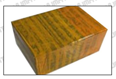
Pic No. 5 International Express Packaging: Wrapped with yellow tape after wrapping black protective film