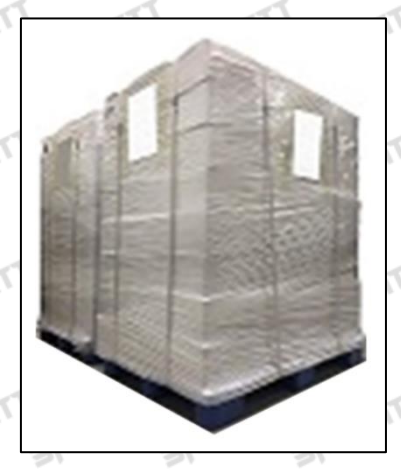
Pic No. 6